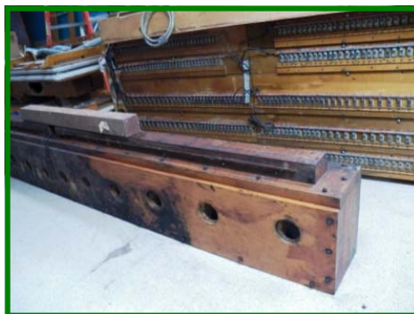
Cleaning Tibia Chest