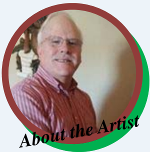
About the Artist