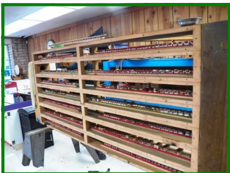
7 Rank Main Chest