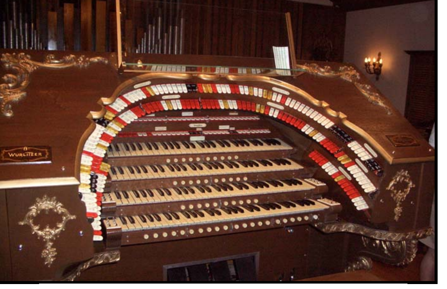
The console of the Wehmeier residence 4/36 WurliTzer