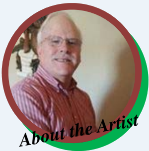
About the Artist