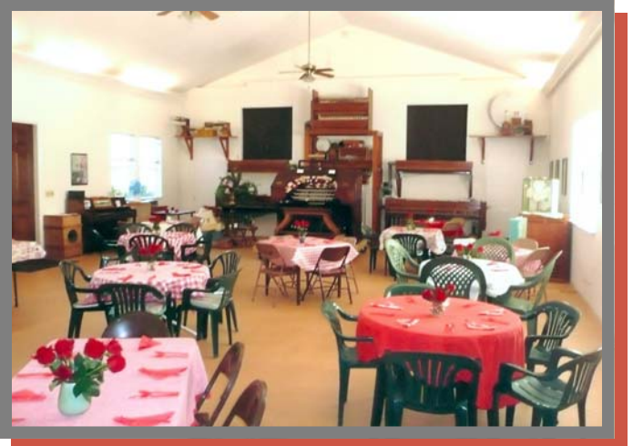
Opus 1496++ in the Shingle Springs Music Room