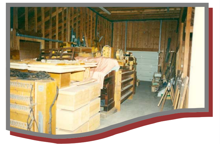
Opus 1496 in pieces at the Mt Aukum barn

With the exception of 2001, there has been a SATOS picnic using Opus 1496 every year since 1994.