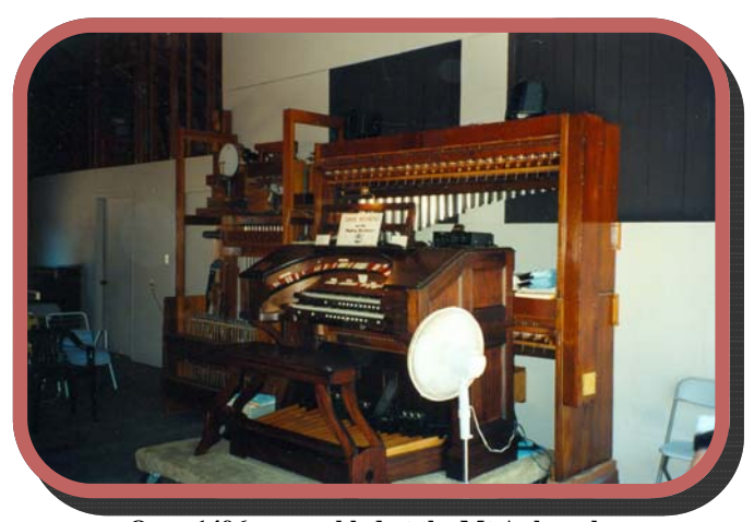
Opus 1496+ assembled at the Mt Aukum barn prior to move to Shingle Springs