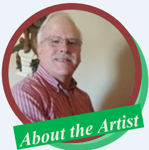
About the Artist