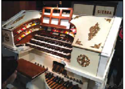
The American Theater Organ Society, Sierra Branch, owns and maintains the wind-driven instrument initially built for a ter to accompany slient films.